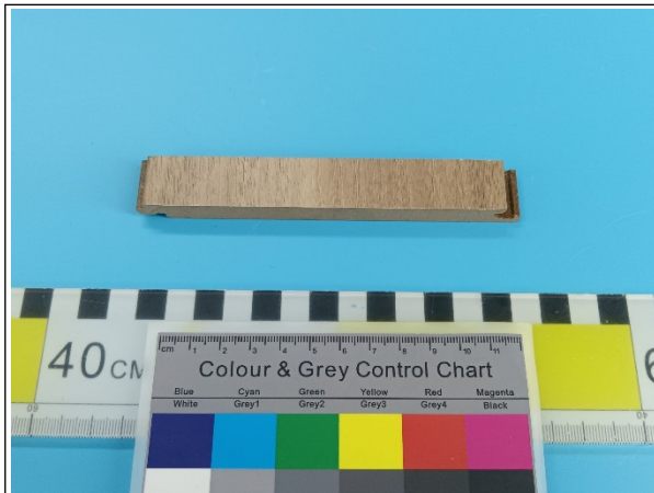
Original Sample-Sample A1